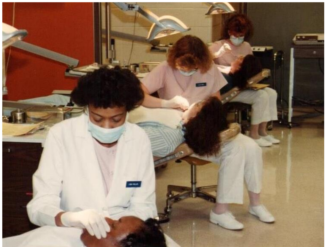
Clayton State dental hygiene students earn clinical hours serving patients at the free dental clinic on campus.