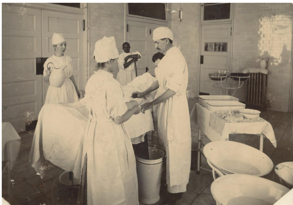
Saint Joseph Infirmary, staffed by Sisters of Mercy.