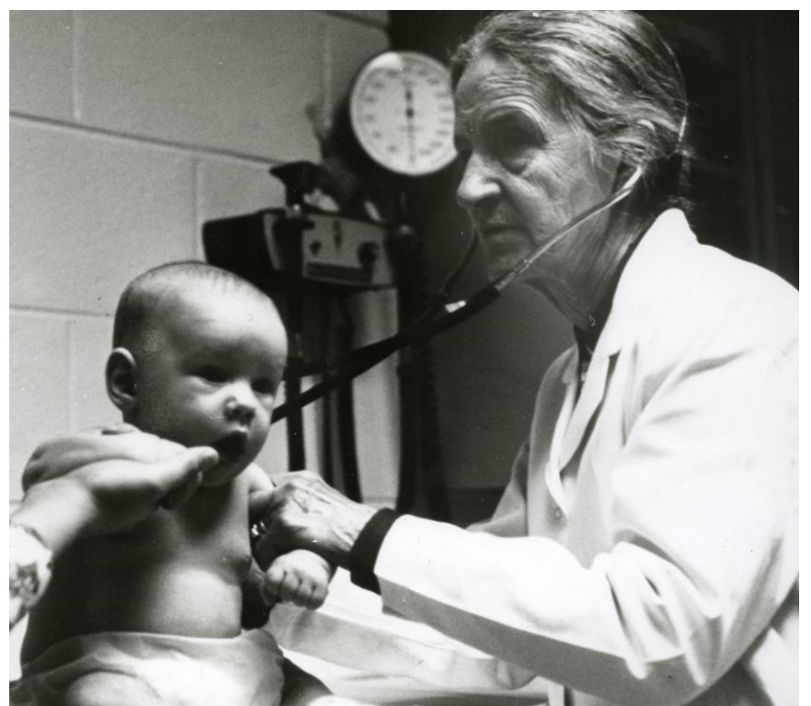
Dr. Leila Denmark with an infant patient at the Baby Clinic of the Central Presbyterian Church in Atlanta, Georgia.