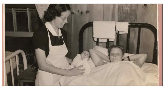
Digital Library of Georgia

You can now digitize photo negatives, slides, or VHS tapes for free in Macon, Georgia, at the Washington Memorial Library's new Memory Lab. Many of Georgia's public libraries can provide expertise on how to preserve family heirlooms and collectibles. Contact your local library to find out how.